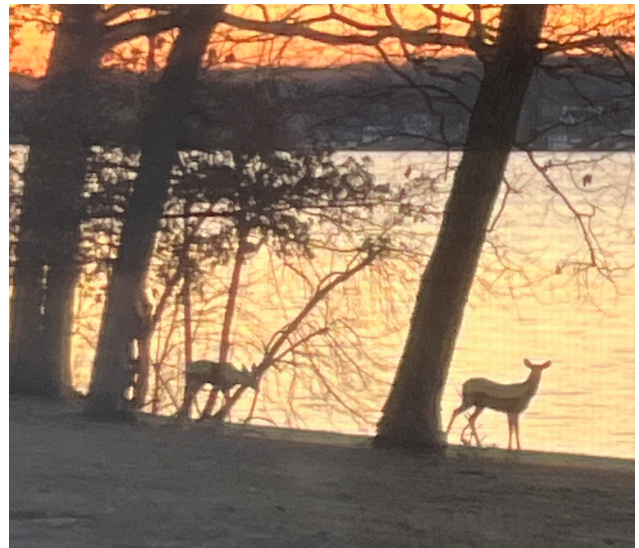
Deer at our home in Delavan